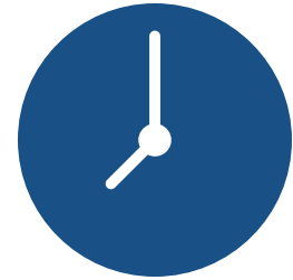
1000+ coaching hours