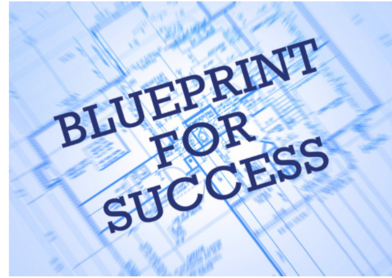
Figure 1. Six Key Characteristics of Successful MLLs