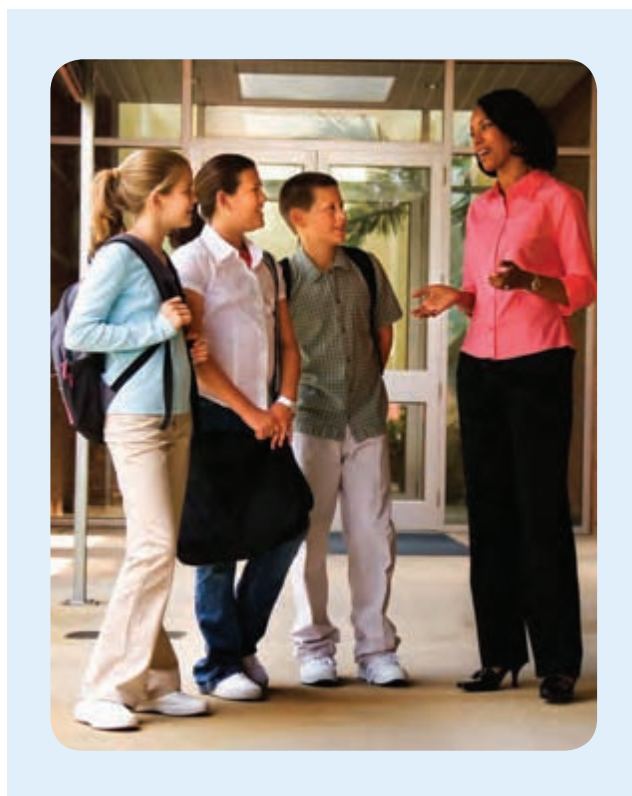
Because the job of leading a school is complex and involves many domains of activity, a district should use multiple measures of principal effectiveness.

Finally, the compensation committee must carefully determine how to weight the various components of the program. Because the job of leading a school is complex and involves many domains of activity, a district should use multiple measures of principal effectiveness and make sure that the relative weight of each of these measures is in alignment with expectations for leader effectiveness and award amounts.