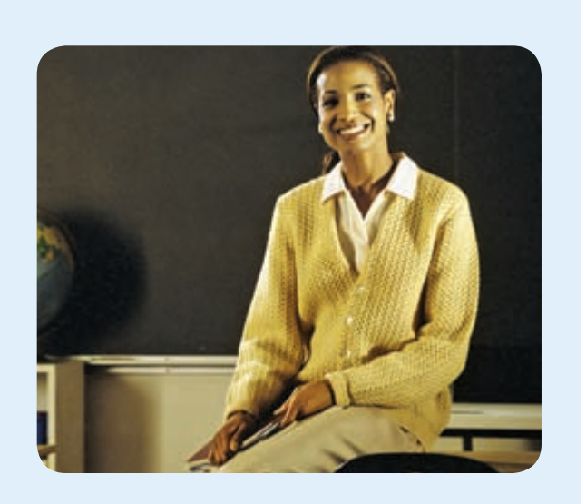
In addition to standardized test scores, districts can use many other school-level indicators to measure leader performance.

Many districts reward teachers for assuming additional roles and responsibilities that will enhance the quality of instruction in their schools, such as mentoring or coaching other teachers. Administrator compensation systems, too, are often designed to reward principals for taking on additional roles and responsibilities, such as leading a high-poverty, low-performing school or serving as a mentor.